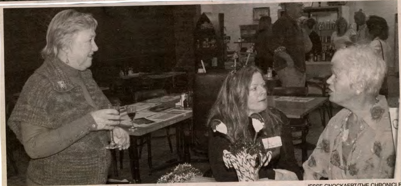
JESSE CNOCKAERT/THE CHRONICLE