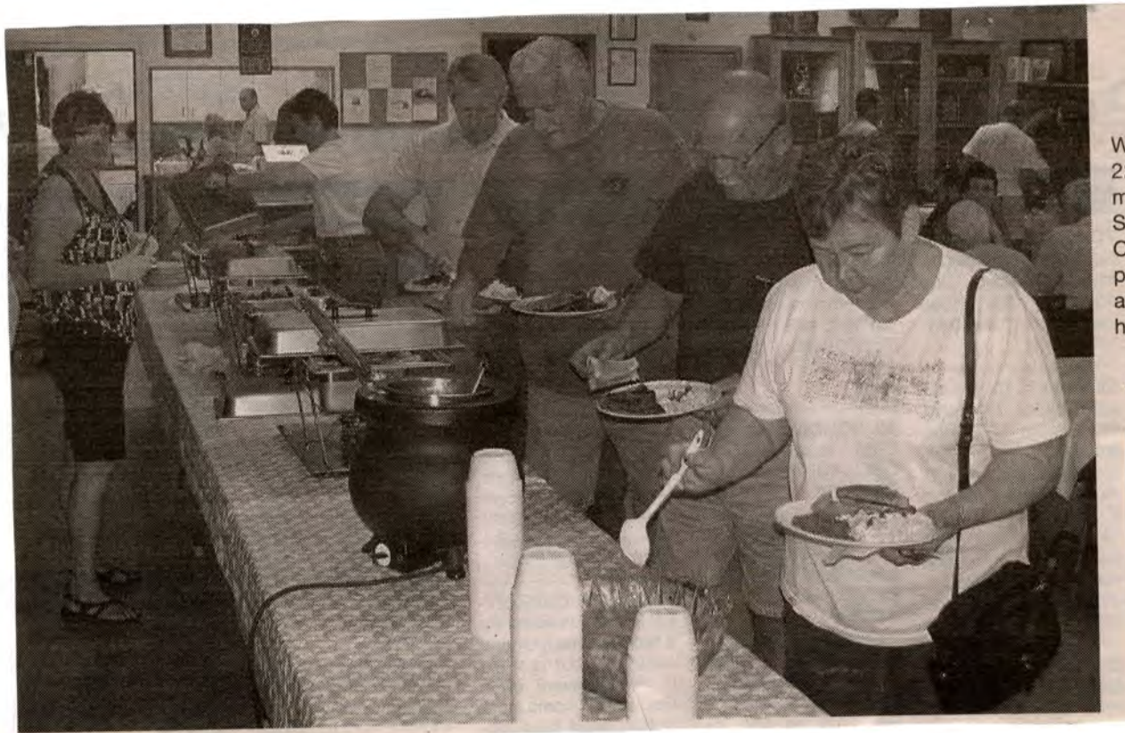
West Elgin Legion Br. 221 held their monthly breakfast on Sunday, August 2. Over 200 hungry patrons were served and a great time was had by all.